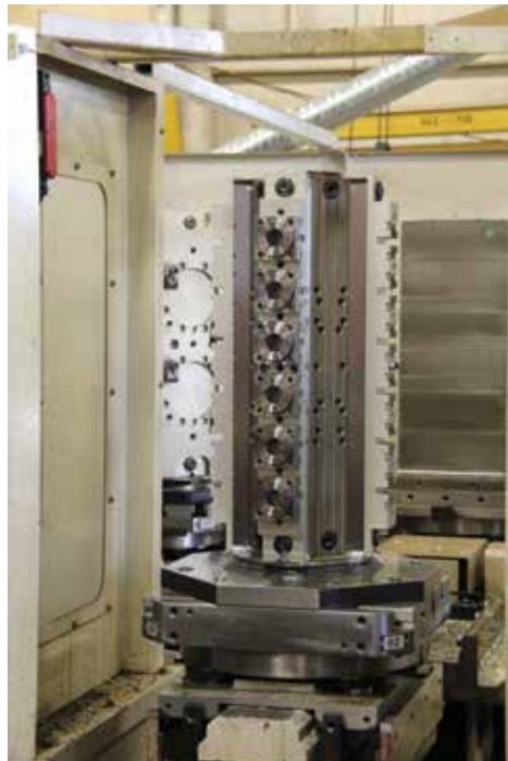
One of the custom-built tombstones loaded in the DHP 5000.

"We're taking on some similar principles we've adopted on the DHP with the Haas," says Remillard. "I'm working closely with Fifth Axis, because we purchased their vise system for the Haas machine tool. Fifth Axis sent me solid