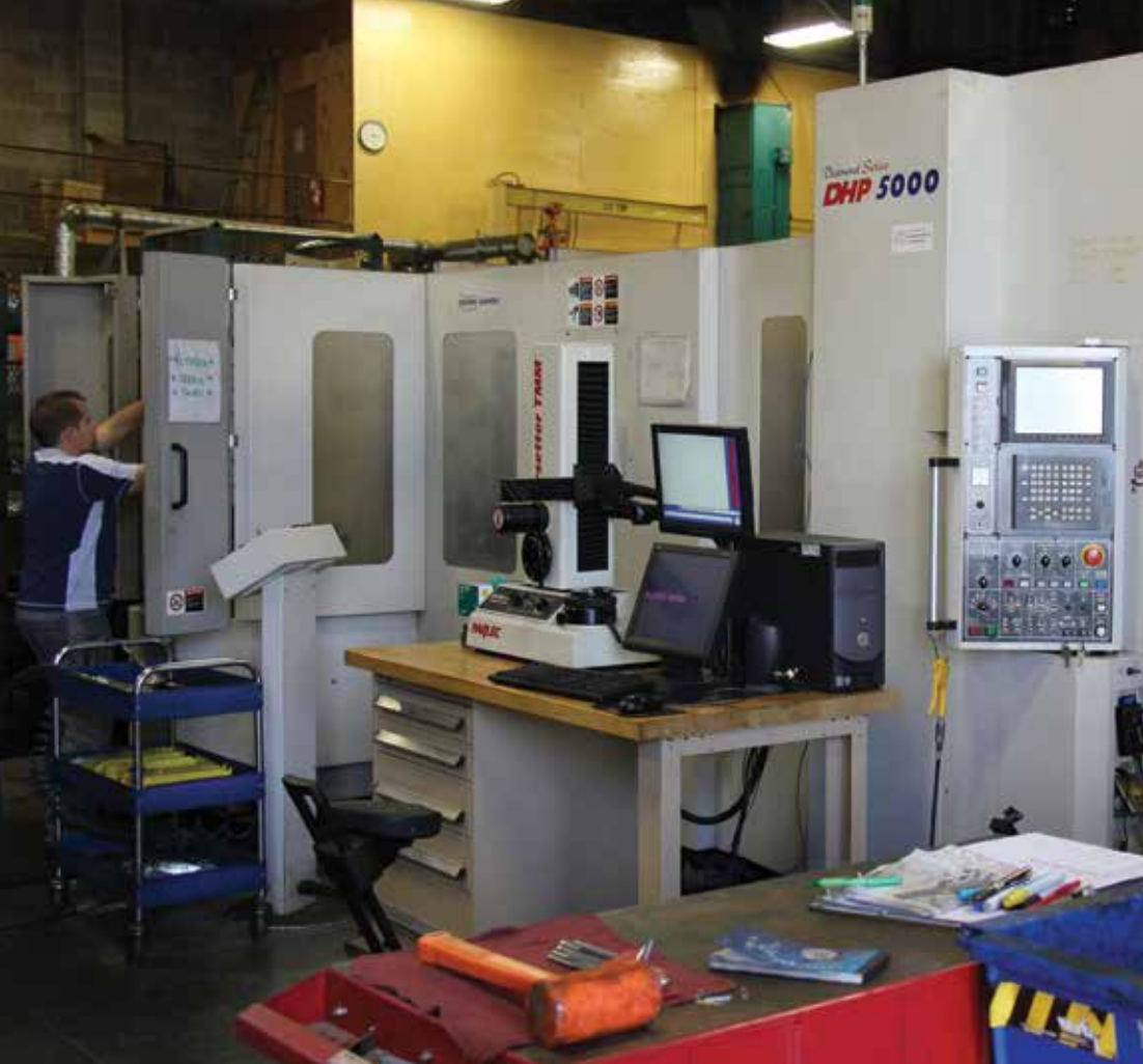
Left: The tombstone being loaded on the DHP 5000 at Westcoast Cylinder. Below: The new Haas UMC-750 5-axis machine in operation on the Westcoast Cylinder shop floor.